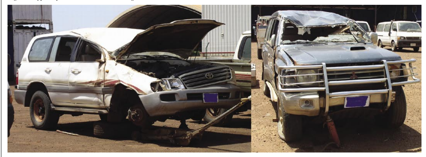
Figure 1 Typical fatal rollover crash damage

15% of road fatalities were attributed to truck crashes in 2001. One of the areas where immediate gains can be obtained is in the crashworthiness design of front, side and rear ends of trucks. Again there are no design standards in Australia covering these aspects of commercial vehicles in Australia. International Standards already exist. Similarly we have yet to see the design of public transport vehicles such as buses, trams and trains take adequate steps to improve their crashworthiness as regards collisions involving other road users