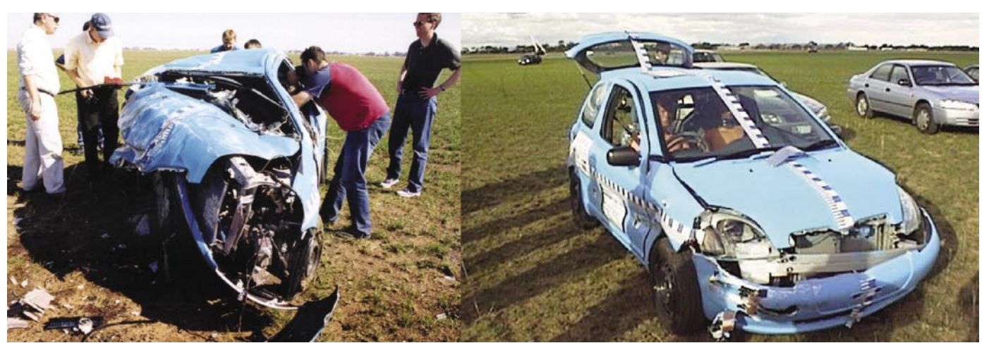
Figure 4 The difference in damage sustained by a small car impacting concrete barrier (left) and a wire rope barrier (right). The test involved the vehicle impacting the barriers at a speed of 80km/h at an angle of 45°.

road safety design, Transport Engineering in Australia , IEAust, Vol.5, No.2, Dec. 1999, (also presented and in proceedings of "Aus Top Tec" Topical Technical Symposia, Society of Automotive Engineers Australia, Melbourne, Aug 1999).