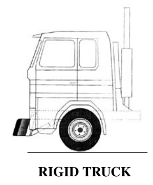
Figure 3 Diagram showing proposed modifications to the front of heavy vehicles, trams and buses incorporating an energy absorbing front under-run barrier (and pedestrian protection pad) [Rechnitzer 1993].

of serious injury to pedestrians and bicyclists. The design of vehicles can be modified to reduce serious injury risk and in concert speeds can be reduced in pedestrian active-areas.